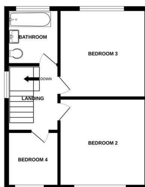
1ST FLOOR 387 sq.ft. (36.0 sq.m.) approx.